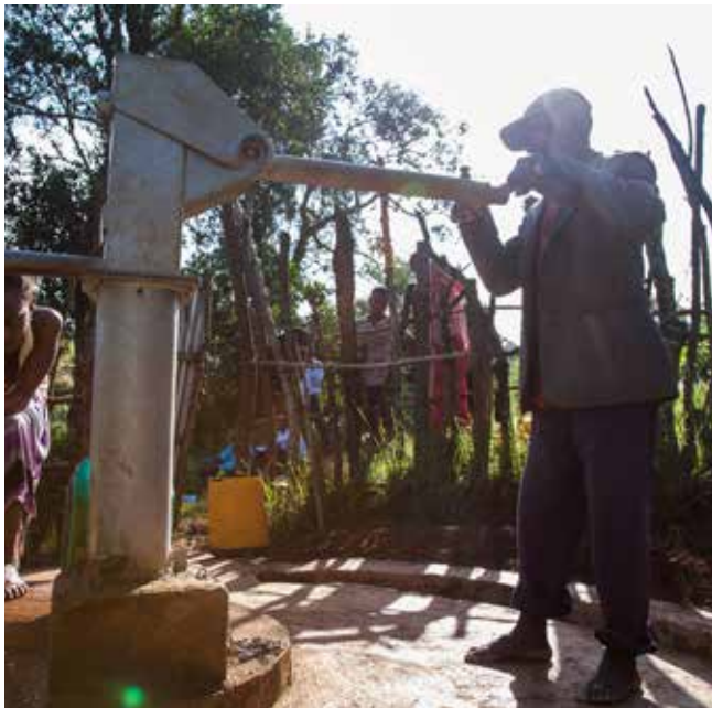
In this pool, people in the surrounding villages fetched drinking water, washed clothes and watered their animals.