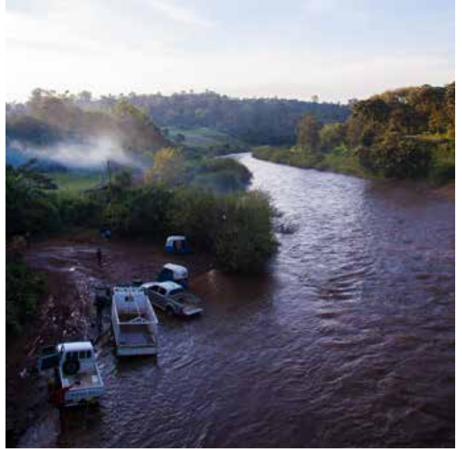
The three CAV villages Yobi Dola, Haro and Goljo lie in the Hurumu District.