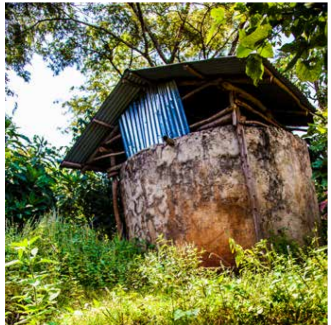
A simple but effective irrigation system supplies the fields of 30 families with water. It allows them to grow a large selection of vegetables, spices and fruit, where people previously struggled to cultivate maize and teff.